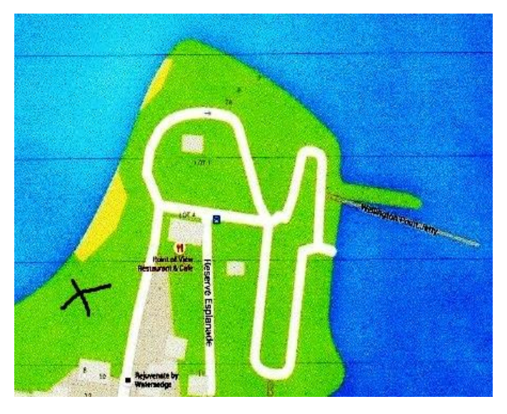
X is the RGSQ Marquee Christmas cake and Fruit Platter supplied.

After a very successful 'Christmas picnic in the park' in 2015, we have decided to make Wellington Point the destination for RGSQ's Christmas party in 2016 as well. Bring along your own picnic lunch/drinks, sunscreen, the kids, the grandchildren, a hat and a chair, and join us to celebrate the end of another very successful RGSQ Geographical year.