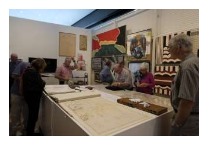
Photo: RGSQ members during visit to Fryer Library, UQ, September 2018.