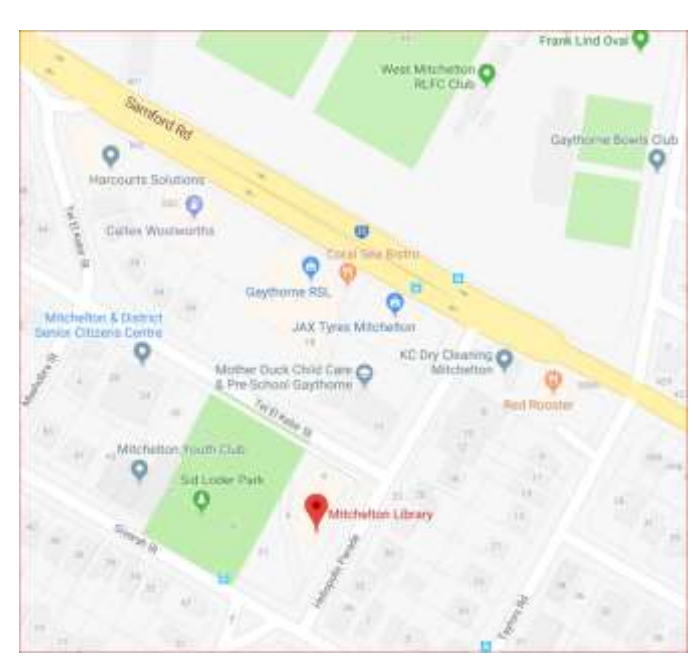
Map with directions to Mitchelton Library, 37 Heliopolis Parade, Mitchelton QLD 4053