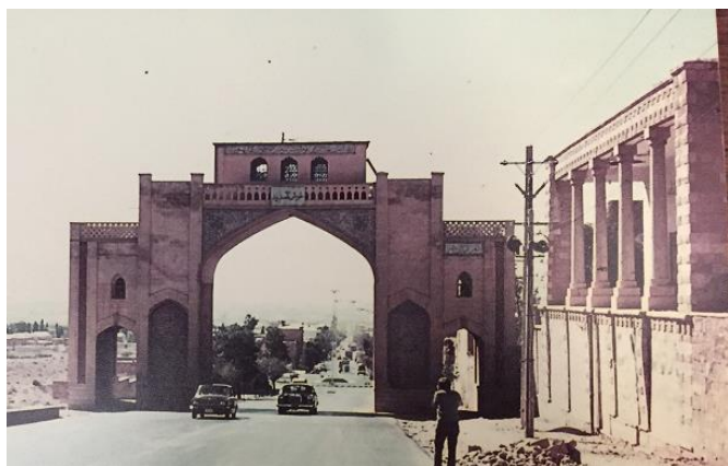
Shiraz city gate, Iran 1972

It is with deep gratitude to the university lecturers and all my town planning employers that I enjoyed and was fully challenged and satisfied by 20 years of working as a town planning consultant. I was fascinated by the four years of subjects required to be undertaken. Often, I sat perched on the edge of the lecture-room chair, fascinated by the content being given by the lecturers. The European and Australian cities that were given as examples of historical town planning, or excellent town planning, were those I had visited when I was a backpacker in my early 20s.