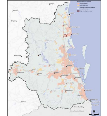
Figure 1. The SEQ Urban Footprint

The State of Queensland. Shaping SEQ: South East Queensland Regional Plan (August 2017) Department of Infrastructure, Local Government and Planning, Brisbane.