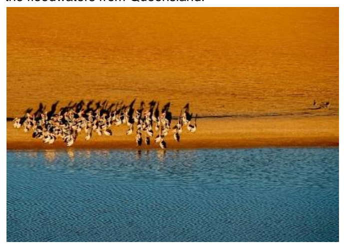
Pelicans on the shore of Lake Eyre.

While communities in north-west Qld were devastated, and an estimated 500,000 cattle were killed, pastoralists and wildlife in outback SA are reaping the benefits from the floodwaters from Queensland.