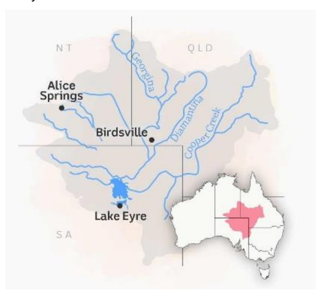
Lake Eyre Basin.

By Iraphne Childs based on ABC News and TV 7.30 Report, 9 May 2019