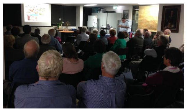
Over 40 RGSQ members attended the special general meeting and monthly lecture at RGSQ's new premises on May 7.