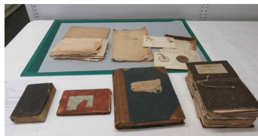
The Tryon collection held in the Museum library with RGSQ's 1874 diary, 2nd from the left.

Tryon also identified methods to combat insect pests troubling the Queensland sugar industry, especially the cane grub (or larvae of the numerous cane beetles in Queensland). In an era before insecticides, Tryon advised Queensland's canegrowers to collect cane grubs and cane beetles by hand – children earned pocket money doing this task – destroy the beetles' feeding trees, and fumigate the soil with carbon bisulphide which killed the cane grubs (all methods used by the state's canegrowers between 1900 and 1940). In the mid-1900s, Tryon also identified that Metarhizium anisopliae , a fungal pathogen, was fatal to cane grubs, but, unexplainedly, he did not pursue this finding. In 1991, his research was re-examined by CSIRO scientists trying to find a new way to kill cane grubs, following the Commonwealth government's ban on the insecticide BHC which was widely used by Queensland's canegrowers.