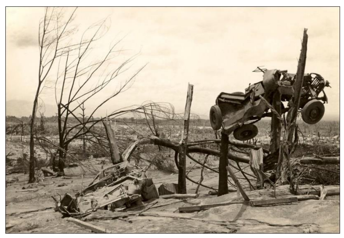
The devastation at Higaturu

Until just six days before the catastrophic eruption, when minor tremors were felt and steam appeared, Mt Lamington was not even known to be an active volcano. There had never been any indication of activity recorded in the 150 or more years since European explorers first sighted the mountain, nor was its reputation as a "fire mountain" contained in the oral traditions and myths of the Orokaiva people that occupy the area. As a consequence of this rapid onset and uncertainty as to its likely behaviour there were no orders to evacuate the government station at Higaturu and the nearby Anglican mission at Sangara; nor the Orokaiva villages and hamlets that were spread across the northern foothills of the mountain. These were all wiped out.