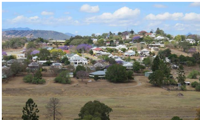
#19 Boonah township looking south from Athol Terrace by Ralph Carlisle

There were 4 images that the committee recognized as highly commended: