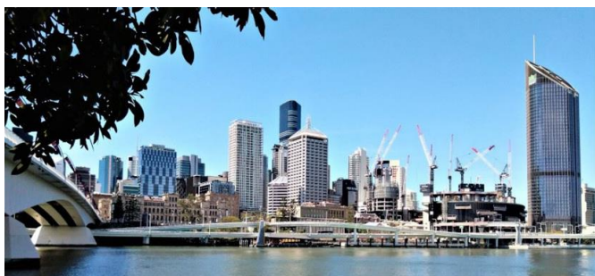
#37 The Generations of the Brisbane Skyline by Stuart Watt