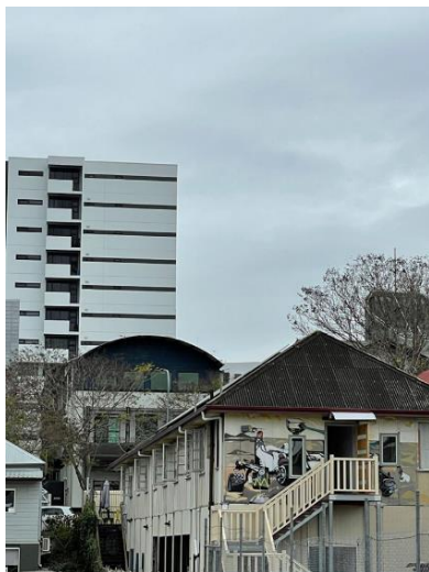
#27 Changing skyline in Brisbane West End by Kay Rees