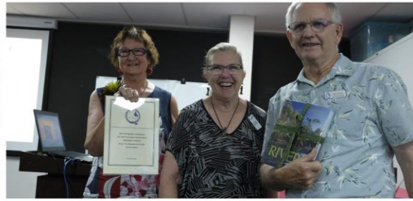
Images from the Society's Christmas party, 7 December 2021, credit Kay Rees.