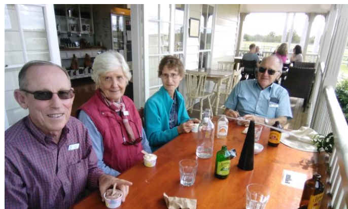
Members at Summerland Camel Dairy with Dessert gelato ice cream.