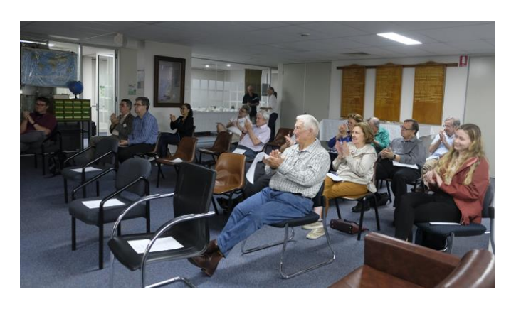
Members attending the 2021 AGM on premises