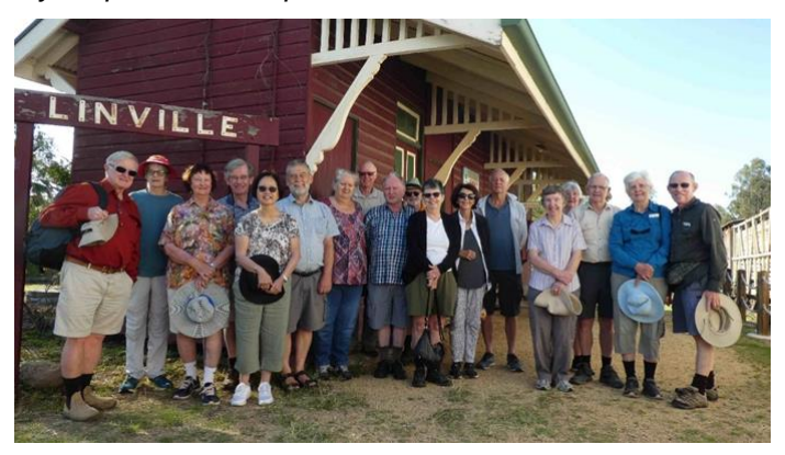
RGSQ group at the former Linville Railway Station (operated 1910 to 1993)

This self-drive two-day trip explored the Upper Brisbane and Stanley River Valleys from Wivenhoe Dam to the East Branch of the Brisbane River and to Mary Cairncross Park overlooking the Stanley River catchment. The trip itinerary focussed on themes reflecting the physical and human geography of the UBV. Speakers from SEQwater and Somerset Regional Council gave overviews on topics of a geographical nature, particularly water management, geology and agricultural activities.